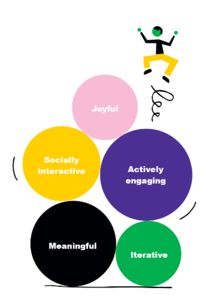
Figure 2: 5 Characteristics of Play, LEGO Foundation

Look at the 5 Characteristics of Play to the left. Notice that play is joyful, meaningful, actively engaging, iterative, and socially interactive- and each playful activity may have multiple Characteristics of Play in the same activity!