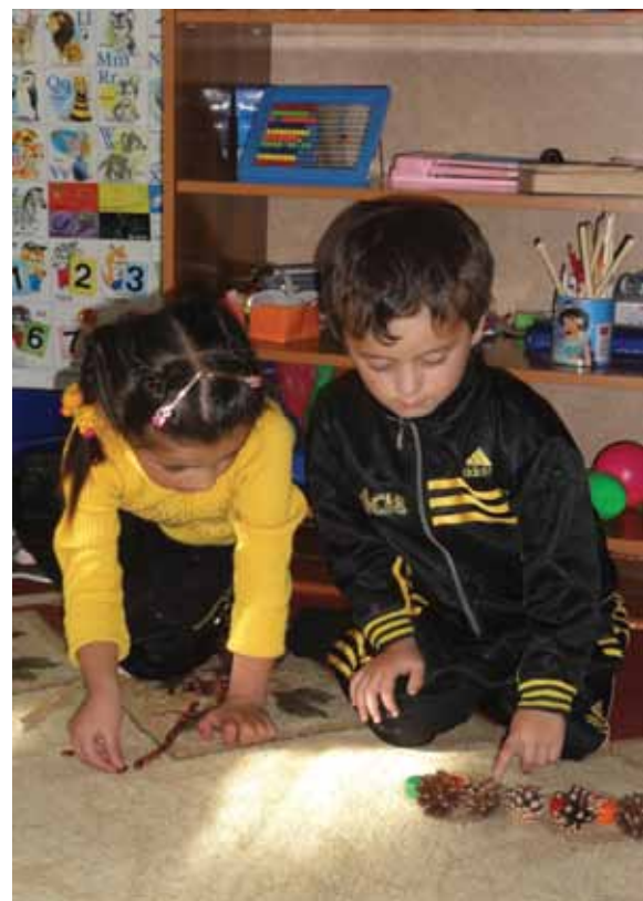
Comparison girls tested better than boys, but the programme closed this gender gap, with similar scores for boys and girls.

Impact: By its second year, the programme provided ECD for about eight percent of eligible children in the programme areas. Since then demand has resulted in significant growth, and in 2012, the programme reached 34 percent of 4- to 6-year olds in Gorno Badakhshan Autonomous Oblast.