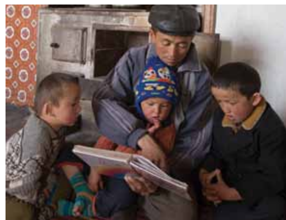
The study in Kyrgyzstan showed that there was a cumulative advantage for children with both ECD experience and access to mini-libraries.

Impact: The ECD centres, mini-libraries and accompanying parent workshops have been in increasing demand by parents. The Ministry of Education has purchased many of the books developed by AKF for distribution to schools and kindergartens nationwide. A pre-school law which passed in 2010 fully endorsed the alternative models developed by AKF and others. Operational costs are met primarily by government with communities providing the balance.