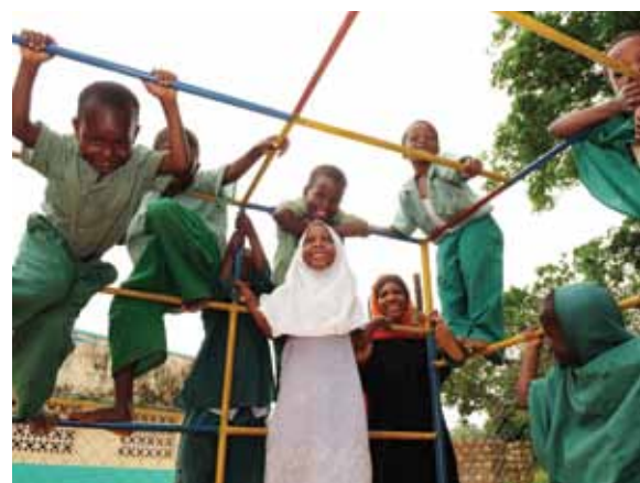
Attendance in a Madrasa pre-school classroom was reported to have a significant effect on the development of children’s social competencies, as compared to that of children from other pre-schools.

The standardised assessment tools, evaluating such skills as reasoning ability, visual cognition and verbal comprehension, were extensively pre-tested, translated and back-translated, and administered to children in their local language by trained graduate assistants working in pairs.