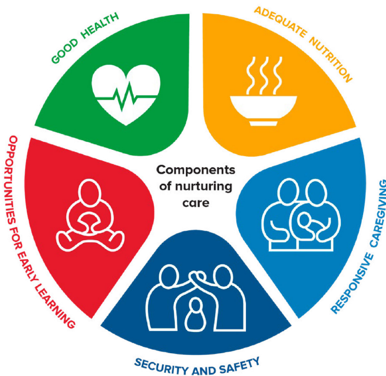
Fig. 1 Components of Nurturing Care for ECD