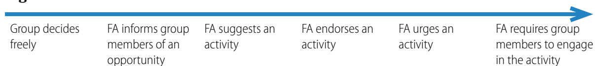
Figure 1: Choice Continuum

Discussions of risk management 10 usually point to strategies that include diversification, provisioning, mitigation (reducing the impact of negative occurrences), reduction of risk (decreasing their probability), and if possible transferring the risk to someone else. All of these seem to be appropriate strategies for Facilitating Agencies, except the last, if it involves transferring the risk to the Savings Group itself. Development agencies have a moral responsibility (though much less frequently a legal responsibility) for the outcome of their actions and it is argued here that two factors increase that moral responsibility in the case of OAs: the degree of risk, and the degree of choice. The more that the groups place at risk, and the less they have a say in the matter, the more the Facilitating Agency is accountable for the outcome.